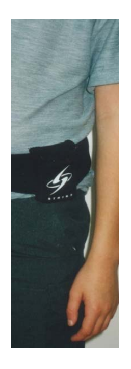
Figure 1 The RT3 activity monitor

The activity monitors are RT3 tri-axial accelerometers, manufactured by Stayhealthy, USA, which measures movements in three directions, as shown in Figure 1. The RT3s combine all three acceleration vectors to produce an overall vector magnitude (VM) expressed in terms of activity counts. These can be converted into activity calories using formulae programmed into the equipment using data on the age, gender, weight and height of the child. Activity calories are calories used in undertaking physical activity. The RT3s can also convert activity calories to total calories, that is, including the calories that are used by the body to function and develop even when the person is passive, by adding on a constant