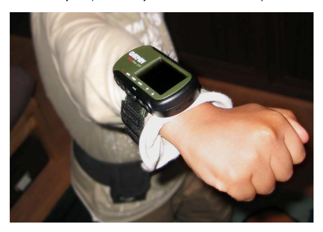
Figure 2 The Garmin Foretrex 201 GPS monitor

The GPS is a satellite-based positioning system. Twenty four GPS satellites are orbiting the earth at a very high altitude. By picking up signals from these satellites, a GPS receiver can locate the user's position on the ground with a relatively high accuracy of several metres. Several types of GPS equipment were tested, in order to decide the best in terms of precision, battery life and acceptability to the children. The GPS equipment used in the CAPABLE project is the Garmin Foretrex 201 which is small and light-weight so that children can easily wear it on their wrists all day long, as shown in Figure 2. It monitors children's locations at set intervals and records them in its memory in chronological order. These data can be superimposed subsequently on a map or input into a GIS (geographic information system) so that they can be linked with other spatial data and analysed.